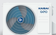
Outdoor unit KGE